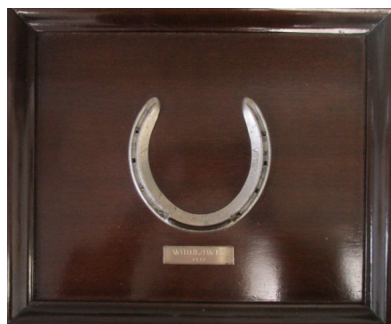
Horseshoe won by 1941 Triple Crown winner Whirlaway, a recent addition to the Kentucky