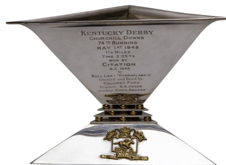
1948 Triple Crown Trainer Trophy awarded to Jimmy Jones, which will be featured at the 2019 Churchill

KDM is opening several spring exhibits to